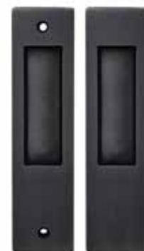
Flush Pull 160 x 40mm